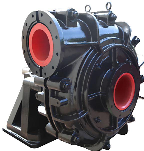
A typical picture of the pump is shown. Please contact Cornell Pump Company for further details. All information is approximate and for general guidance only.

4SPM FRAME MOUNT WITH CHROME IRON LINER 4SPR FRAME MOUNT WITH RUBBER LINER